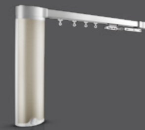
Glydea ULTRA 35e