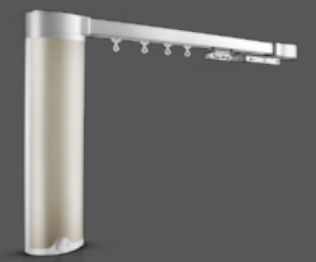
Glydea ULTRA 60e